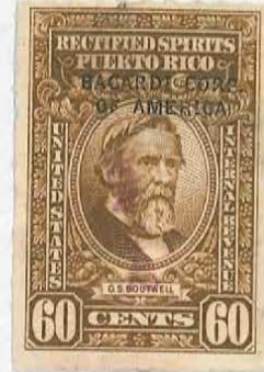
Precancel with Month-Year handstamp