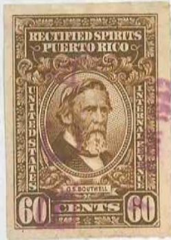
B.C.A. Handstamped with Day-Month-Year handstamp