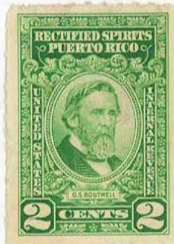
bright yellow green