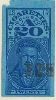
FIGURE I FAINT