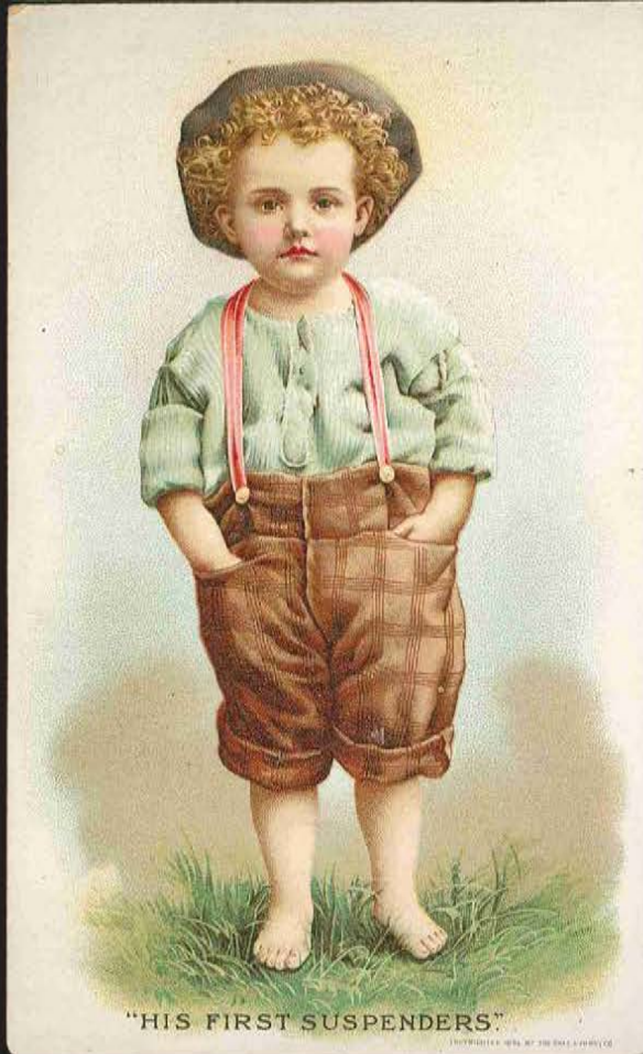
"HIS FIRST SUSPENDERS."